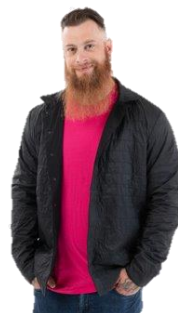
OGIO Shirt Jacket *Launched Q4 2021