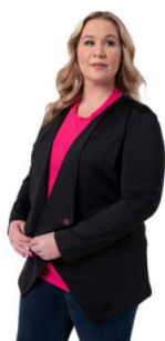
Draped Cardigan *Launched Q1