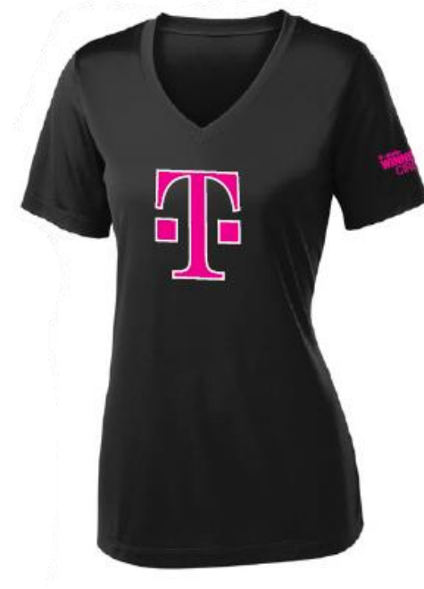
Winners Circle Award Shirt Women