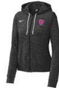
Nike Women's Vintage Hoodie *Launched Q3