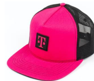
Magenta Hat *Launched 2019