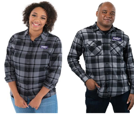
Slate Flannel *Launched Q4 2020