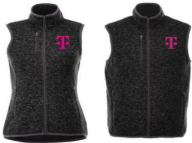
T-Mobile Fontaine Knit Vest - Black *Launched Q4 2020