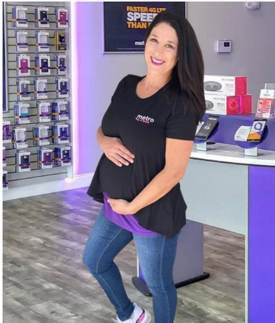
Draped Tulip Maternity Tee *Launched 2020