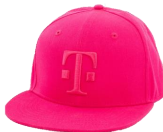
Magenta Hat *Launched 2019