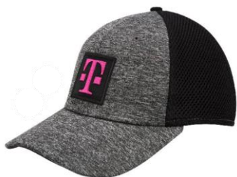
New Era Cap *Launched 2020

Currently available on T-Mobilegear.com *Note: Must be worn forward-facing*