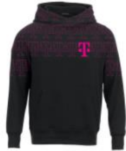
T-Mobile Hoodie *Launched Q4 2020