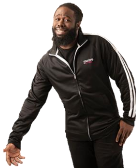
Stormtech Hoodie *Launched Q1 2021