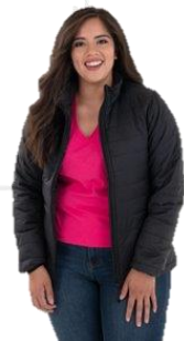
Hyper-Loft Jacket *Launched Q4 2021