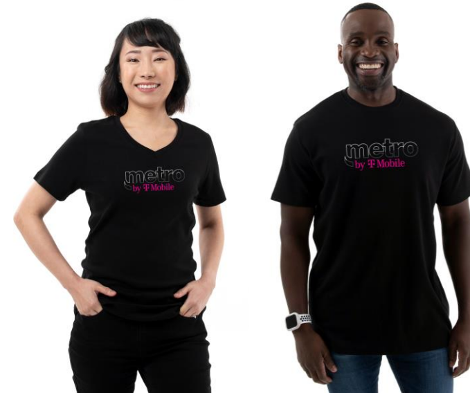
Two-Tone Tee *Launched Q1 2022