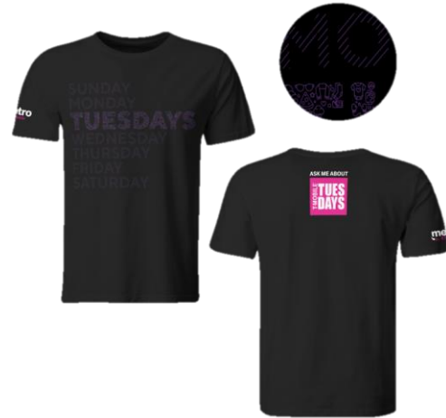
The Tuesday's Shirt *Launched Q2 2021