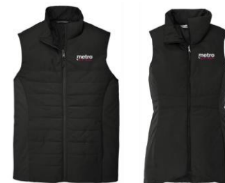
Insulated Vest *Launched 2019