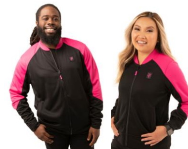
Athletic Fleece Jacket *Launched Q2 2021