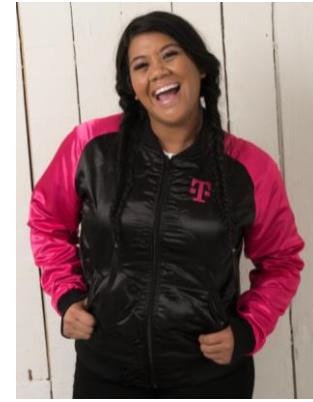
Satin Bomber *Launched 2019