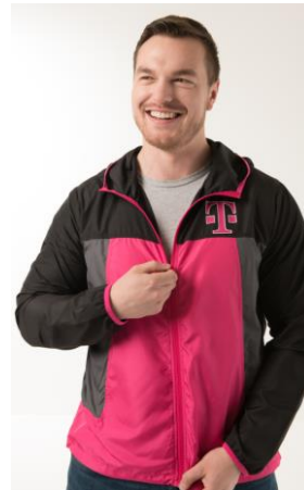
Featherweight Running Jacket *Launched 2019