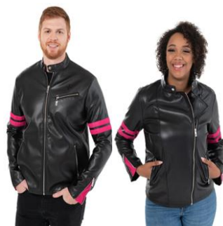
Moto Jacket *Launched Q4 2020