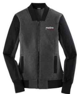
Women's OGIO Crossbar Jacket *Launched 2019