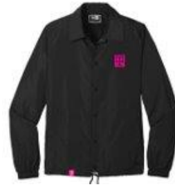
Unisex New ERA Coaches Jacket *Launched Q2