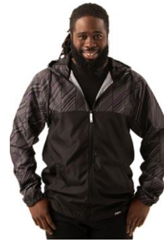
Striped Windbreaker *Launched Q2 2021