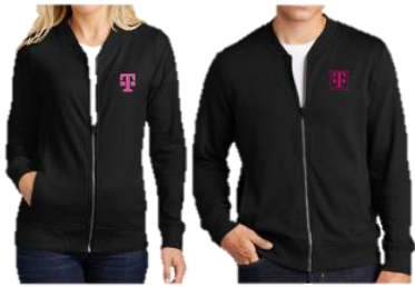
French Terry Bomber *Launched Q1