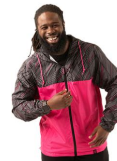
Striped Windbreaker *Launched Q2 2021