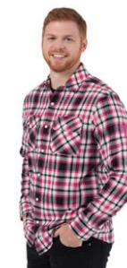
Magenta Flannel *Launched Q4 2020