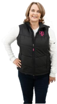
Women's Puffy Vest *Launched Q4