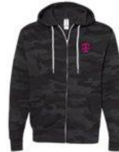
Unisex Full Zip Camo Hoodie *Launched Q3