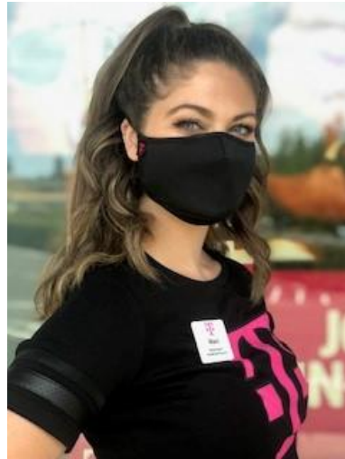
T-Mobile Branded Mask 2.0