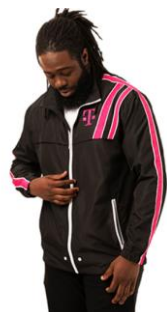
Racer Striped Jacket *Launched Q2 2021