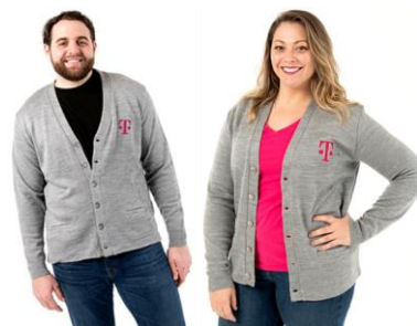
The Sievert Cardigan *Launched Q2 2020