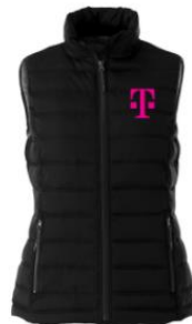
T-Mobile Mercer Vest - Black *Launched Q4 2020