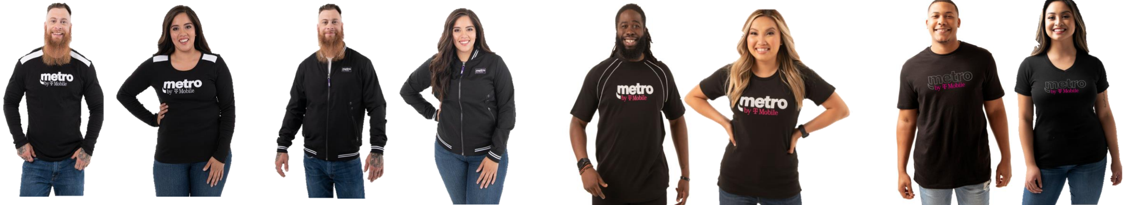
Quilted Long Sleeve *Launched Q4 2021