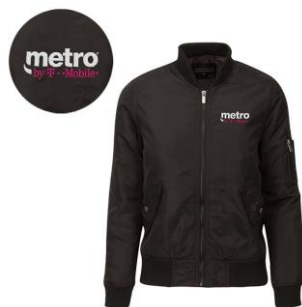
Fossa Bomber Jacket *Launched 2019