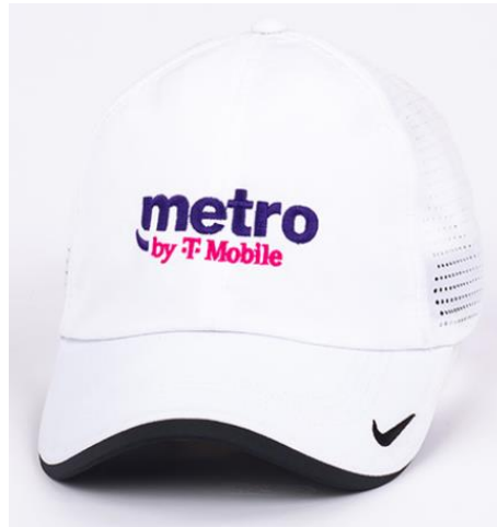
Nike Dri-Fit Hat *Launched Q2 2020