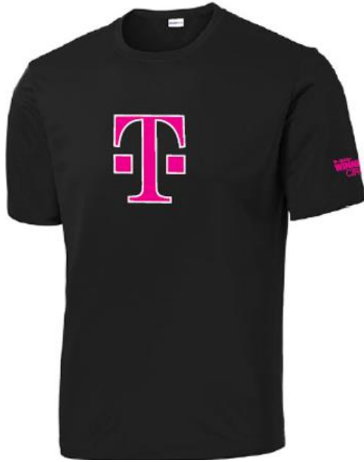
Winners Circle Award Shirt Men