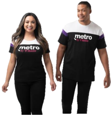
Tri-Block Tee *Launched Q2 2021