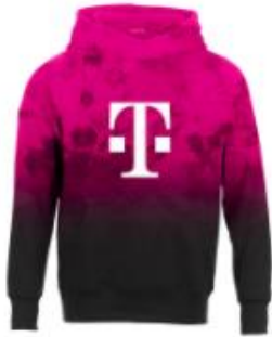
T-Mobile Hoodie *Launched Q4 2020