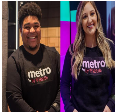
Fusion Sweater *Launched Q1 2021