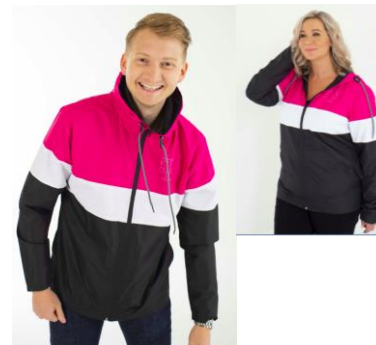
City Block Jacket