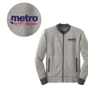
New Era Baseball Jacket *Launched 2019