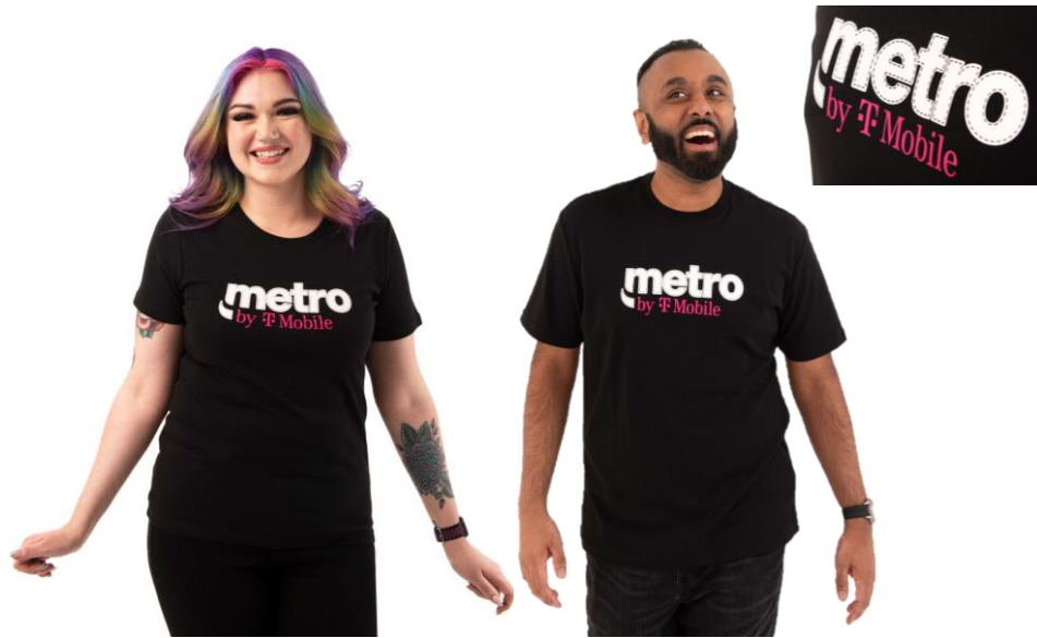
The Stitched Tee *Launched Q3 2022