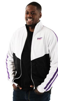
North Face Full Zip Fleece *Launched Q1 2021