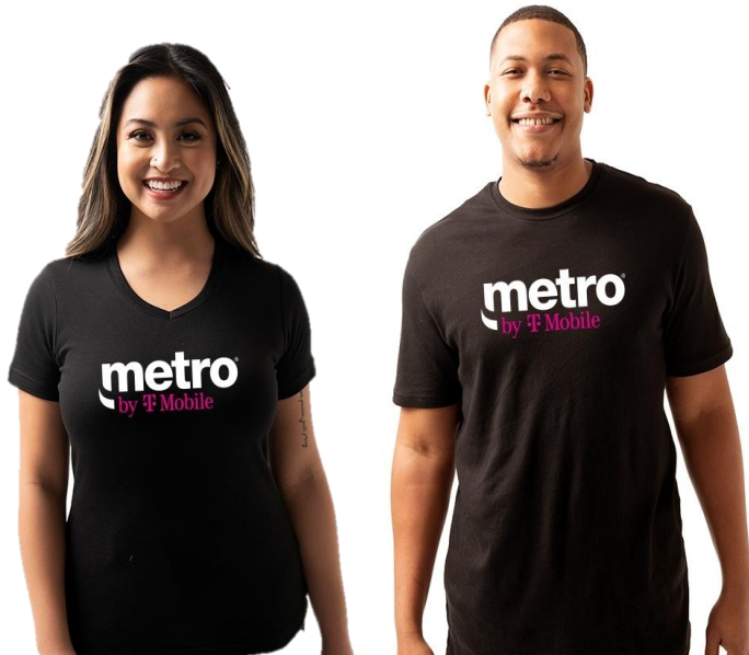
Classic Core Tee *Launched Q4 2020