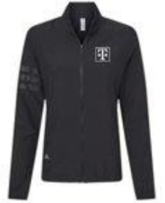
Adidas Women's 3 Stripe Jacket *Launched Q3