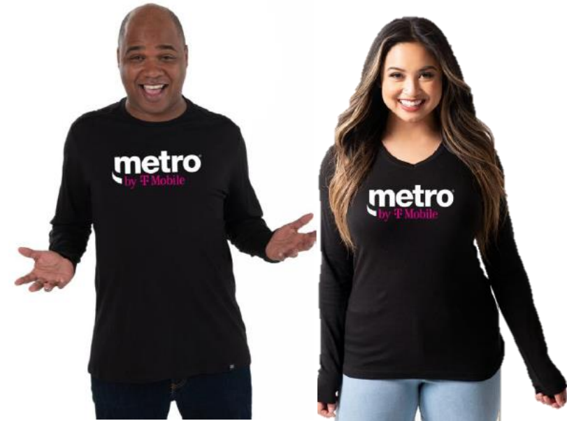
Long Sleeve Core Tee *Launched Q1 2021