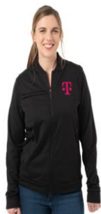
Iconic Varsity Jacket *Launched Q4 2020