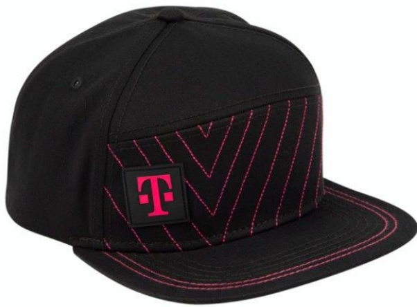
V Stripes Cap *Launched 2020