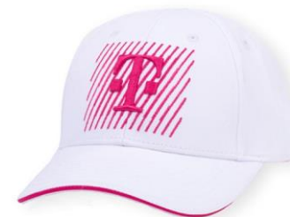
Striped Hat *Launched 2020