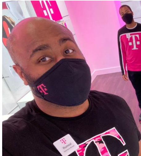
T-Mobile Branded Mask 1.0