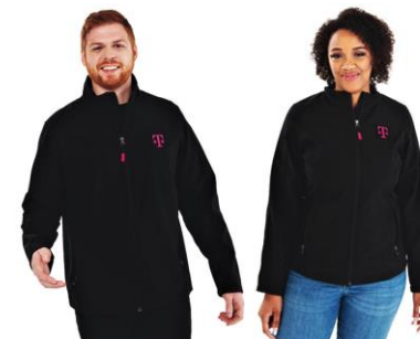
Full Coverage Jacket *Launched Q4 2020