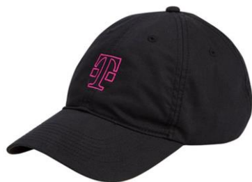
Nike Black Twill Hat *Launched 2019