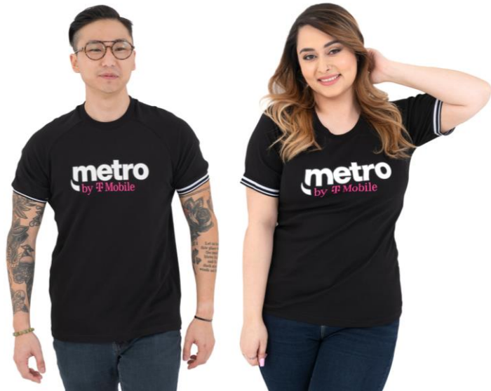
5G Short Sleeve *Launched Q2 2022