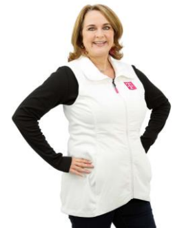
Women's Insulated VEST *Launched Q4