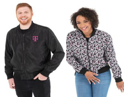
Reversible Bomber Jacket *Launched Q4 2020