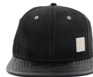
Suede Up Flat bill *Launched 2020