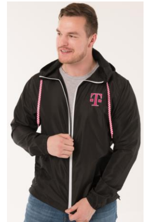
Check This! Windbreaker *Launched 2019