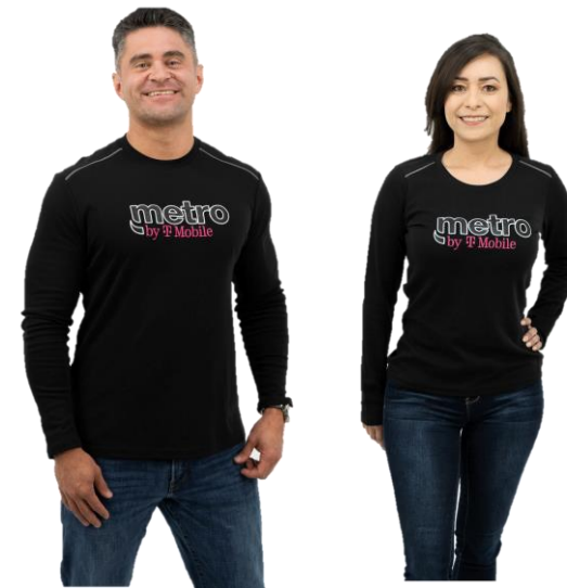
The Cover Stitch Tee *Launched Q4 2022