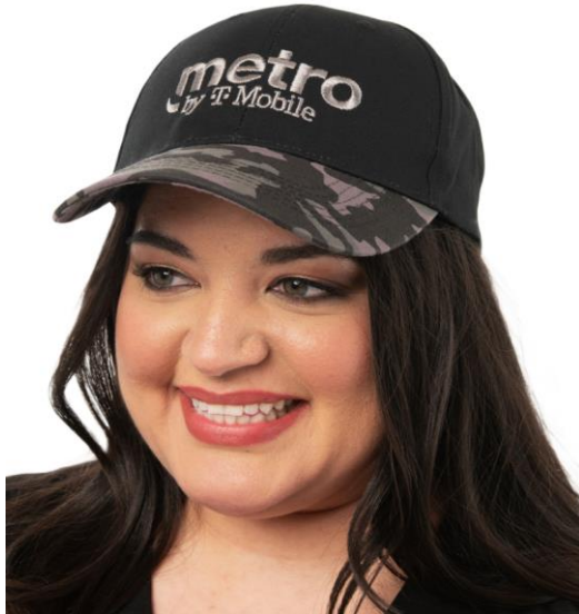
Camo Hat – T-Mobile *Launched Q2 2021