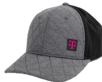
Quilted Hat *Launched 2019