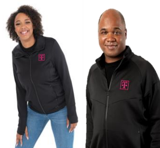
OGIO Endurance Full Zip *Launched Q3 2020