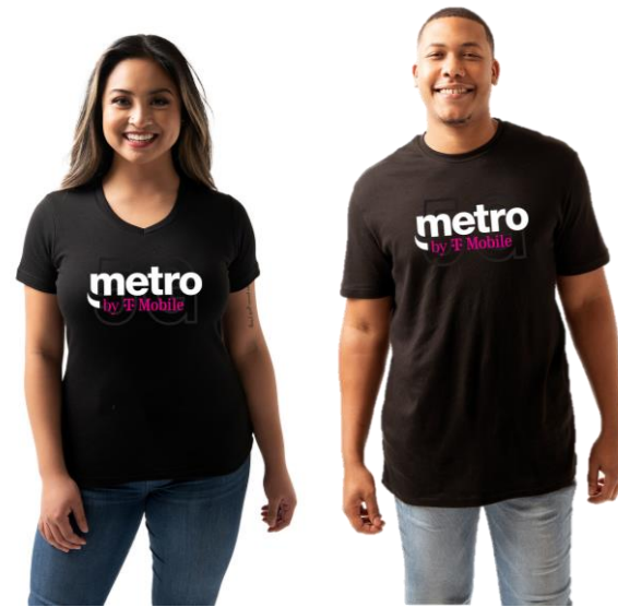
The 5G shadow Tee *Launched Q3 2022