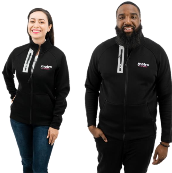
The Reflector Jacket *Launched Q4 2022