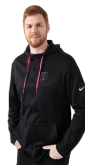
Nike Therma-Fit Fleece Hoodie *Launched Q1 2021