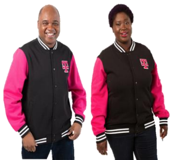
Morpheus Knit Jacket *Launched Q2