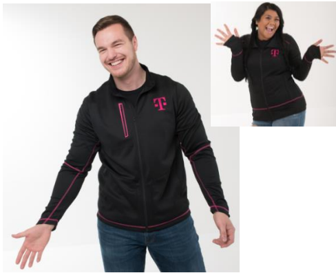
OGIO Fulcrum *Launched 2019