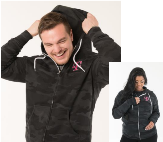
Camo Fleece Hoodie *Launched 2019