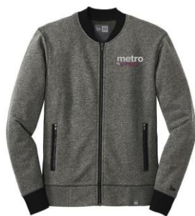
New Era Baseball Jacket *Launched 2019