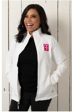
Women's North Face Soft Shell