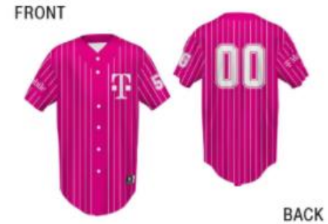
T-Mobile Baseball Jersey *Launched Q4 2020