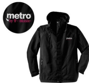
Women's and Men's All-Season Jacket *Launched 2018-2019