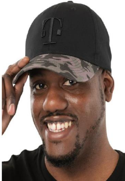
2021 Cameo Hat *Launched 2021