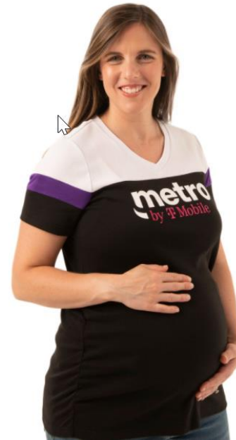
Maternity Tri-block *Launched 2021