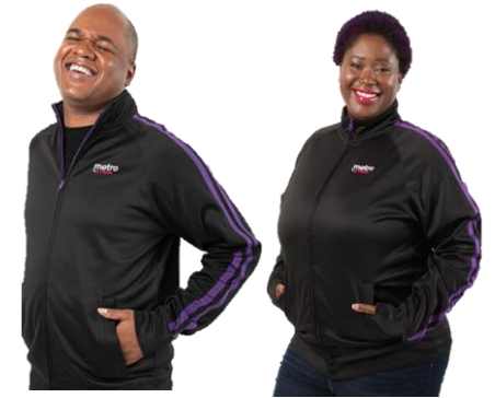
Warm-Up Track Jacket *Launched Q3 2020