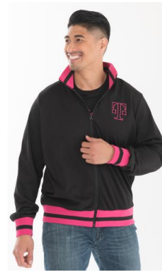
Take Back Track Jacket *Launched 2019