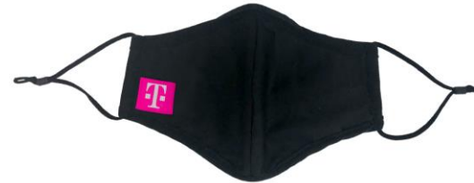
T-Mobile Tuesday Mask