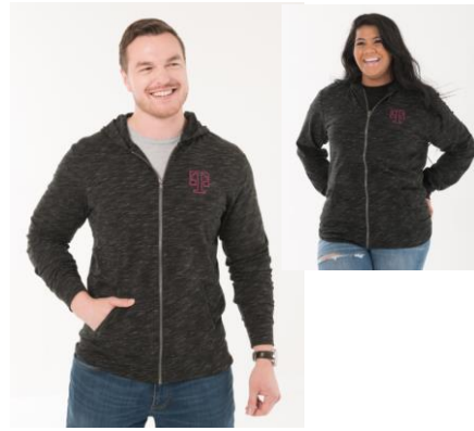
Metal Zip Up *Launched 2019