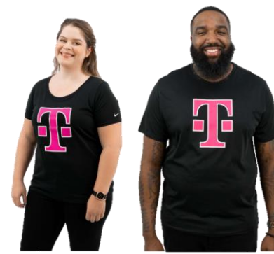
Nike Core Tee *Launched Q4