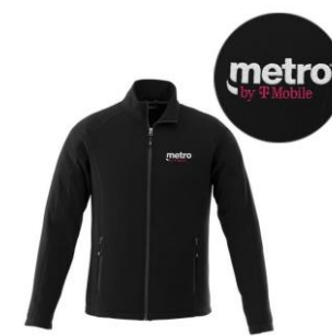
Rixford Fleece Jacket *Launched 2019