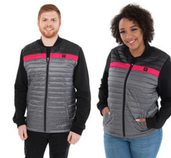
Hybrid Puffer Jucker *Launched Q4 2020