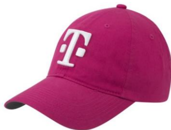
Magenta Nike Twill Hat *Launched 2018