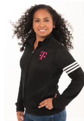
Women's Adidas Zip Up