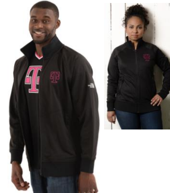
The North Face Tech Jacket