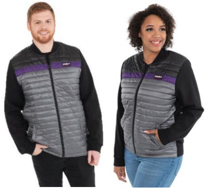
Hybrid Puffer Jacket *Launched Q4 2020