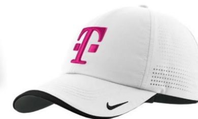
Nike Dri-Fit Hat *Launched 2018