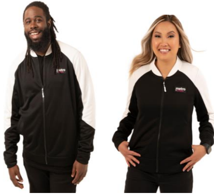
Athletic Fleece Jacket *Launched Q2 2021