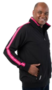
Warm-Up Track Jacket *Launched Q3 2020