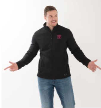
OGIO Grit Fleece