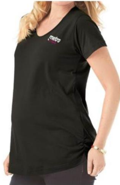
Draped Tulip Maternity Tee *Launched 2020