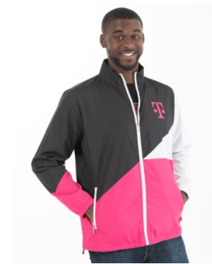
Retro Block Jacket