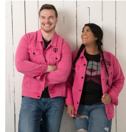
Magenta Denim Jacket *Launched 2019