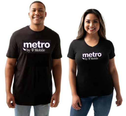
Wired For 5G Tee *Launched Q1 2021