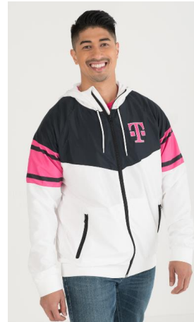
Wind Runner Jacket *Launched 2019