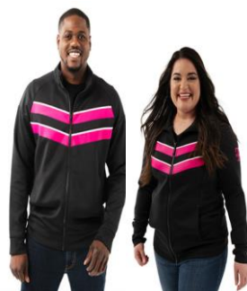
Chevron Jacket *Launched Q2 2021