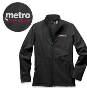
Fleece Lined Softshell *Launched 2019