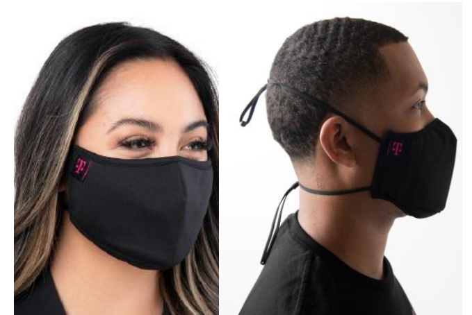
T-Mobile Branded Mask 3.0