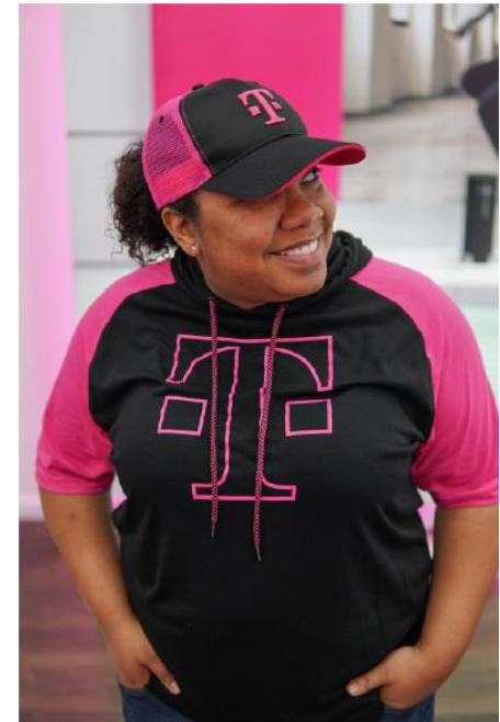
2019 Trucker Hat *Launched 2019