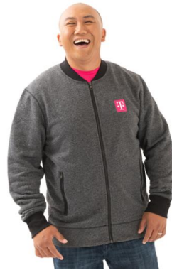
New Era Baseball Bomber