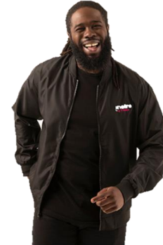
Lightweight Bomber Jacket *Launched Q2 2021