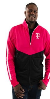
T-Mobile Track Jacket *Launched Q1 2021