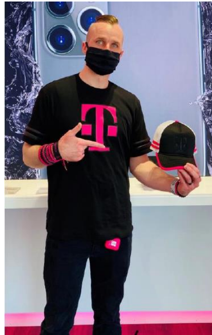
2020 Double Take Trucker Hat *Launched 2020