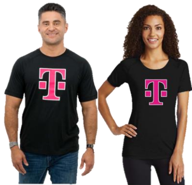
Tri-blend Core Tee *Launched Q4