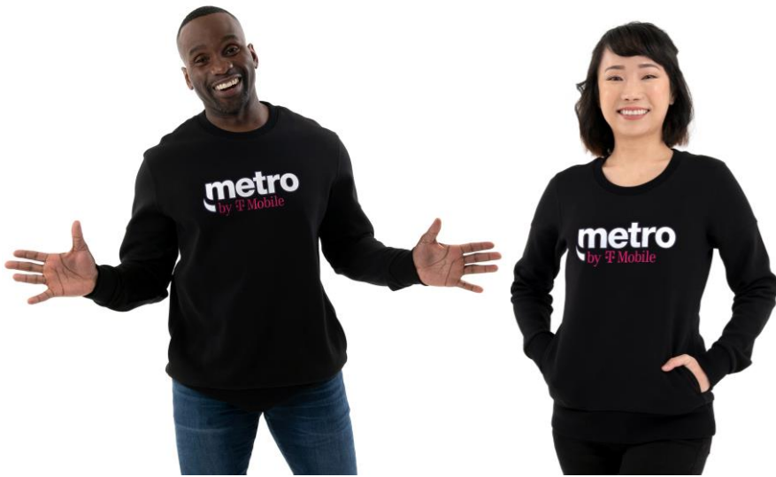
Pocket Sweatshirt *Launched Q1 2022