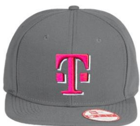
New Era Flat Bill *Launched 2020