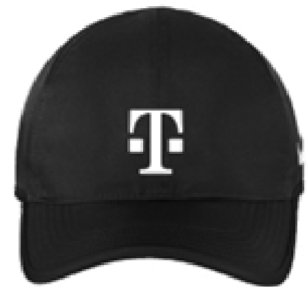
Nike Featherlight Cap *Launching 2022