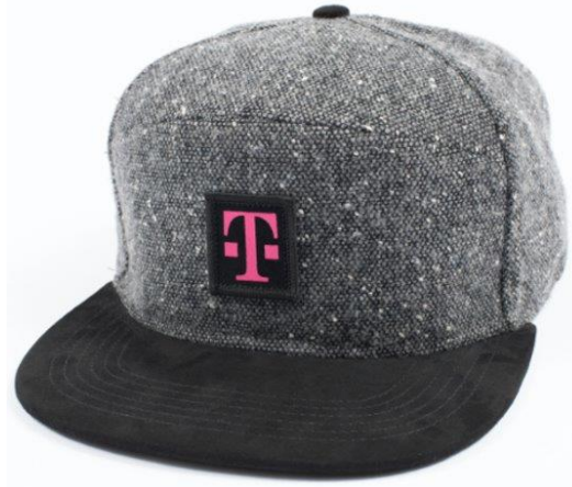
Wool Blend Hat *Launched 2020