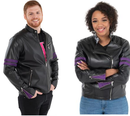
Moto Jacket *Launched Q4 2020