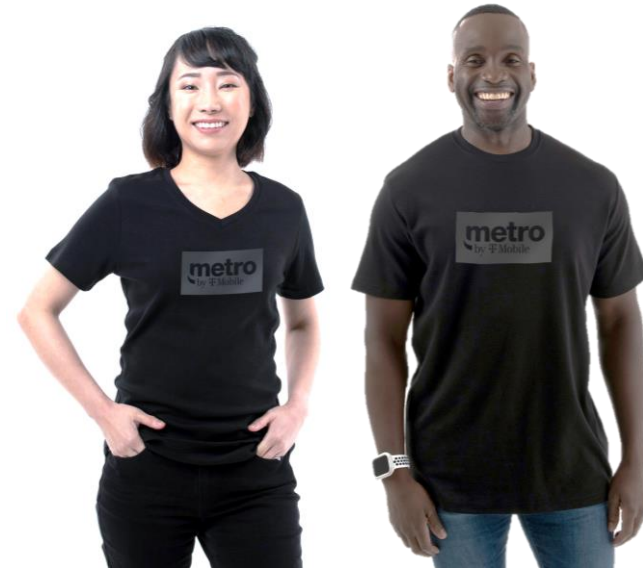
Tonal Tee *Launched Q2 2022