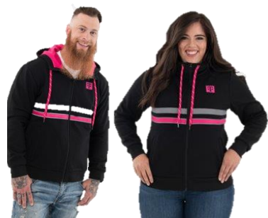
Contrast Band Hoodie *Launched Q4 2021