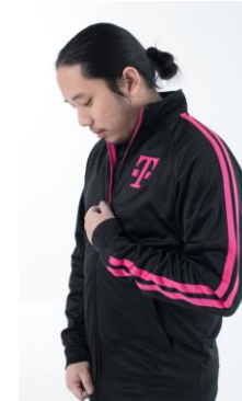
Arm Strip Track Jacket