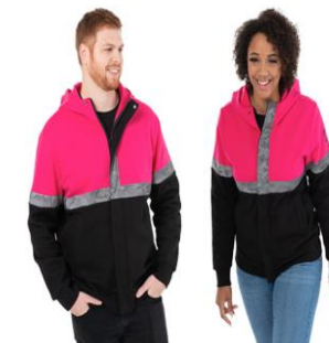
Reflective Camo Hoodie *Launched Q4 2020