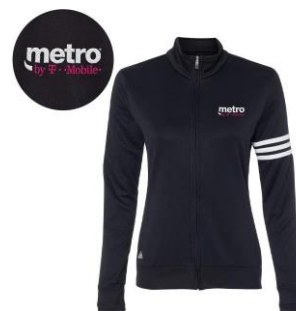
Women's Adidas Full Zip *Launched 2019