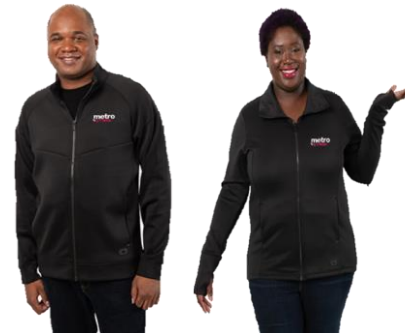
OGIO Endurance Full Zip *Launched Q3 2020