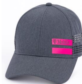
Breathable Heathered Hat *Launched 2020