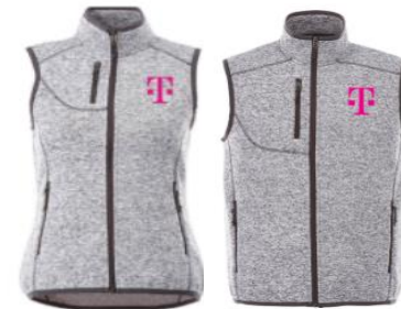
T-Mobile Fontaine Knit Vest – Steel Gray *Launched Q4 2020