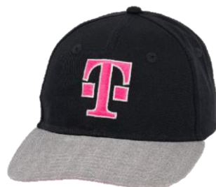
Snap, Crackle, Pop *Launched 2020