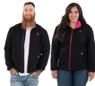
Fleece Jacket with Magenta Collar *Launched Q4 2021