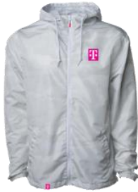
Lightweight Windbreaker White Camo *Launched Q1