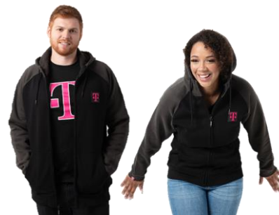
Stormtech Hoodie *Launched Q1 2021