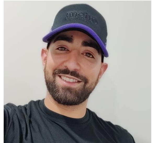
Double Take Trucker Hat *Launched Q2 2020