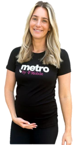
T-Mobile Stitched Maternity Tee *Launched 2022