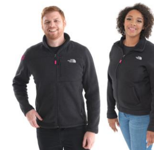
North Face Full Zip Fleece *Launched Q1 2021